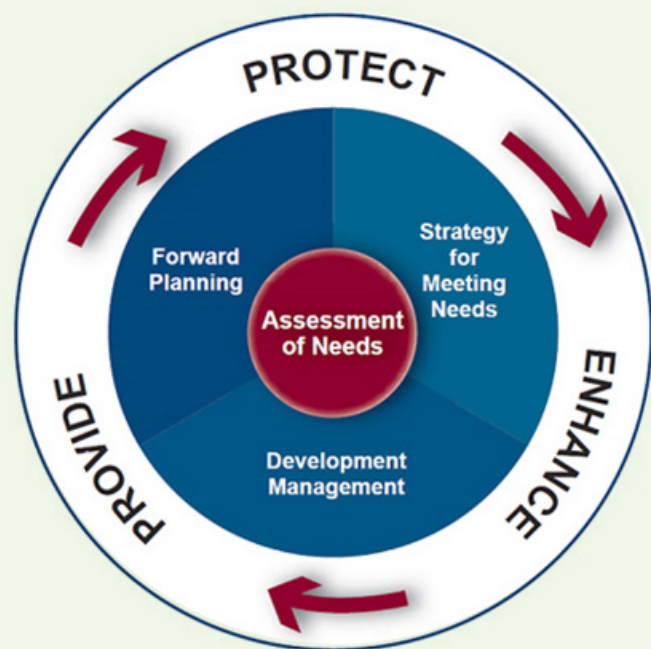
Figure 1: Planning for Sport model

Recommendations are drawn from the Indoor Built Facilities Assessment Needs Assessment, researched and prepared between September 2018 and November 2018 by specialist sport and leisure consultancy, Knight Kavanagh and Page Ltd (KKP). Both the Assessment Report and this Strategy have been prepared in accordance with Sport England's ANOG (Assessing Needs and Opportunities for Indoor and Outdoor Sports Facilities) Guidance and in consultation with South Somerset District Council (SSDC), Sport England, national governing bodies of sport (NGBs), local sports clubs and key stakeholders.