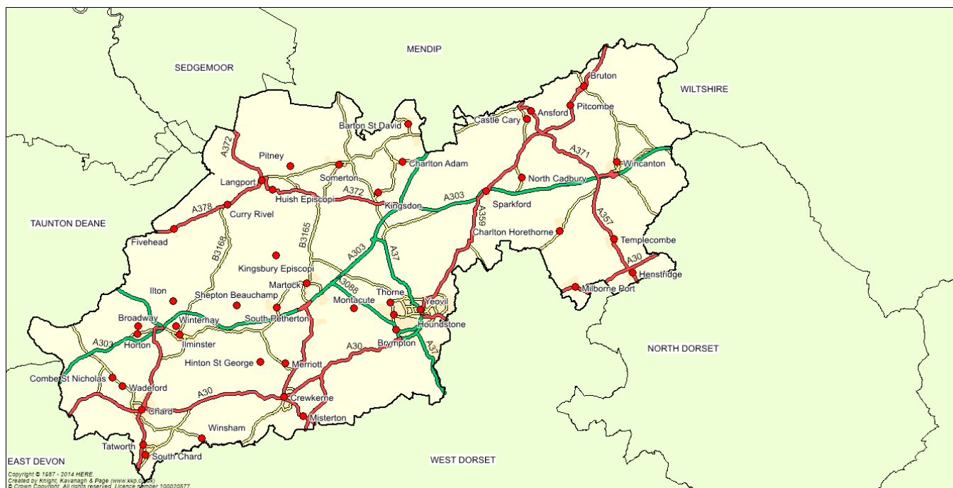
Figure 2.1: South Somerset with main roads and main settlements/ towns

The rural nature of the area means that residents need to travel to access services; this includes sport and leisure facilities. Levels of activity and inactivity are commensurate with regional and national findings. The most popular sports are cycling and swimming. Along with many other areas of the country, child obesity rates increase substantially between the ages of 4 and 11 years.